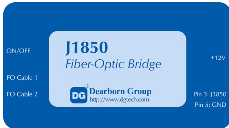
Figure 2: Label for the Class 2 Fiber-Optic Bridge Adapter

Figure 2 that follows depicts the label of the J1850 (Class 2) Fiber-Optic Bridge Adapter.